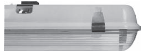
Optional Mounting Brackets and Stainless Steel Latches