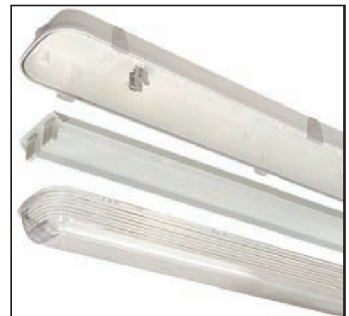
Geartrays carry all the electrical gear. Saves on labor and weight.

Product offering and specifications subject to change without notice.